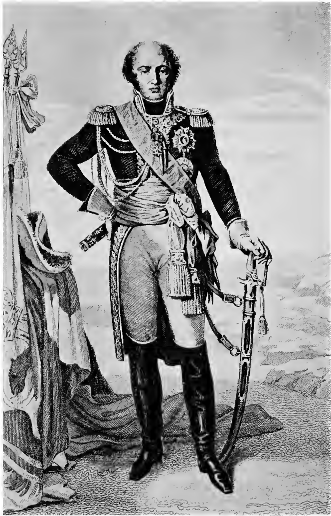
LOUIS NICOLAS DAVOUT, PRINCE OF ECKMÜHL FROM AN ENGRAVING AFTER THE PAINTING BY GAUTHEROT